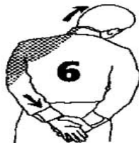
10–12 seconds each arm (page 47)