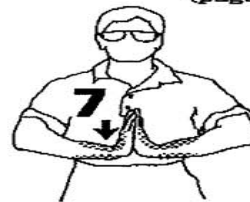
10 seconds (page 89)