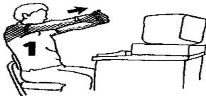
10–20 seconds 2 times (page 90)

Sitting at a computer for long periods often cause neck, shoulder & back stiffness or pain. This can lead to weakness in the postural paraspinal muscles which support your head, neck and low back. Do these stretches every hour or so throughout the day, or whenever you begin to feel stiff. Breathe, relax and gently hold each stretch as you exhale. The stretch should feel good, some mild discomfort may be felt initially, but should subside after a few seconds. Do not over stretch into pain. If you have moderate or severe pain when stretching or sitting at your desk, consult with the medical, physical therapy or chiropractic staff.