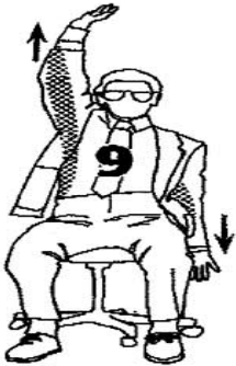
8–10 seconds each side (page 83)