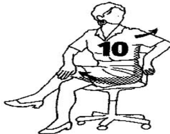
8–10 seconds each side (page 60)