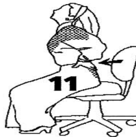
10–15 seconds 2 times (page 46)