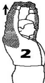
10–15 seconds (page 46)