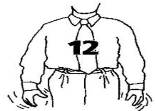
Shake out hands 8–10 seconds (page 89)