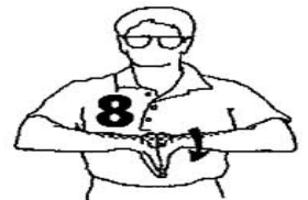
10 seconds (page 89)